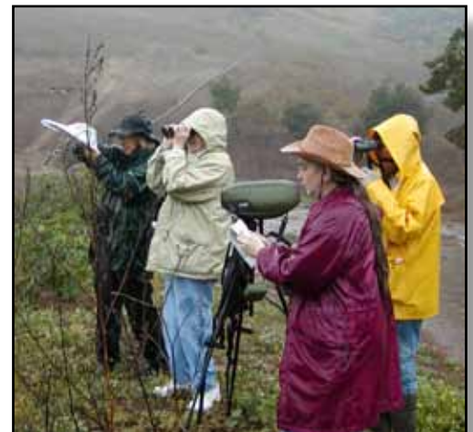
Dedicated birders at Lauro Reservoir.