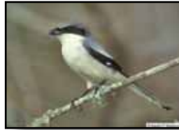
Loggerhead Shrike

We will meet at 7 a.m. on Saturday Feb 11th at the Five Points Shopping Center parking lot near Carl's Jr. We will caravan from there to Lost Hills and then have lunch in the area. From there we will proceed to the Kern National Wildlife Refuge Visitor's Center. If you are traveling independently you can meet us there at approximately 1-1:30 p.m. It is approximately 220 miles to the KNW Refuge. Take Hwy 101 to Paso Robles. Take Hwy 46 east to Lost Hills. Once you cross Hwy 5 look for the sign to the Kern National Wildlife Refuge. The turn off is approximately 5 miles or less past Hwy 5. From the KNWR we will travel to the Colonel Allensworth State Historic Park to view the Burrowing Owls and check on camping availability. After determining where we will camp, we will travel to Pixley National Wildlife Refuge and view the Sandhill Cranes till dark. On Sunday morning we will bird the KNWR for several hours and then begin our return trip home with a side trip to the Wild Wolves Preserve off Highway 166 if interested. We will return home Sunday evening.