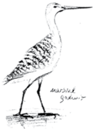
Marbled Godwit