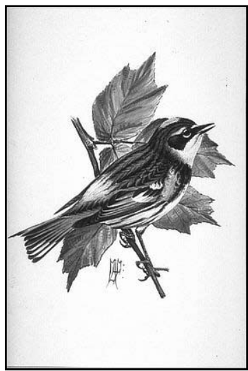
Warbler, Yellow-rumped Louis Agassiz Fuertes Cornell University Library.

Target Birds: Raptors, Woodpeckers, Warblers, Phoebes, Wrens, Kinglets, Towhees.