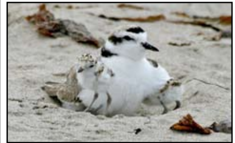
Snowy Plover with chicks