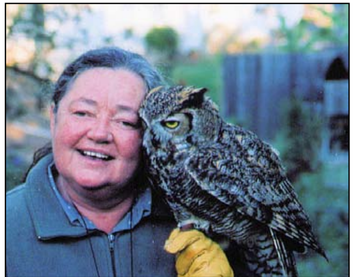
Reunion.

As soon as he saw me he began begging like a baby and chattering excitedly. I had barely lifted up my hand to offer him when he flew down, but fell off the glove somewhat