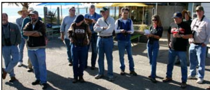
Mid day meeting.

All in all, it doesn't get any better than this. Let's celebrate our incredible bird diversity and lovely climate by going out birding every day of the year—not just for the Christmas Bird Count!