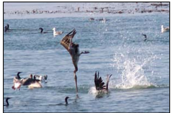
Brown Pelicans.