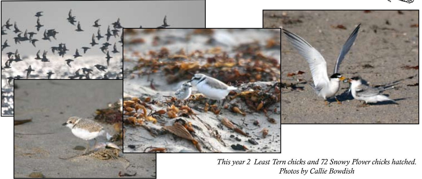
This year 2 Least Tern chicks and 72 Snowy Plover chicks hatched.

The renovated plover nursery, reported in the April-May ET, was put to good use this breeding season, along with a new incubator purchased by SBAS . Skunk predation on plover eggs was very high this year, despite an improved skunk fence and removal of additional non-native shrubs, such that Dr. Cris Sandoval gathered many plover eggs for incubation in the nursery, and replaced the eggs on the beach with wooden eggs painted to resemble plover eggs. The parents continued to incubate the fake eggs, but the skunks lost interest. As the first chick from each brood hatched, Cris returned the clutch to the beach in the parent's nest. As long as the first chick was 2 hours or less old, the parents recognized it as their own and cared for it and its nestmates as they hatched. Seven plover chicks, some injured at other beaches and some from failed nests, were raised in the plover nursery; they were released on the beach when they could fly, at about one month old. Nursery Volunteers were ably managed by Nicole Cerra, with funding secured by SBAS from Shoreline Preservation Fund. Thanks to all the Plover Nursery