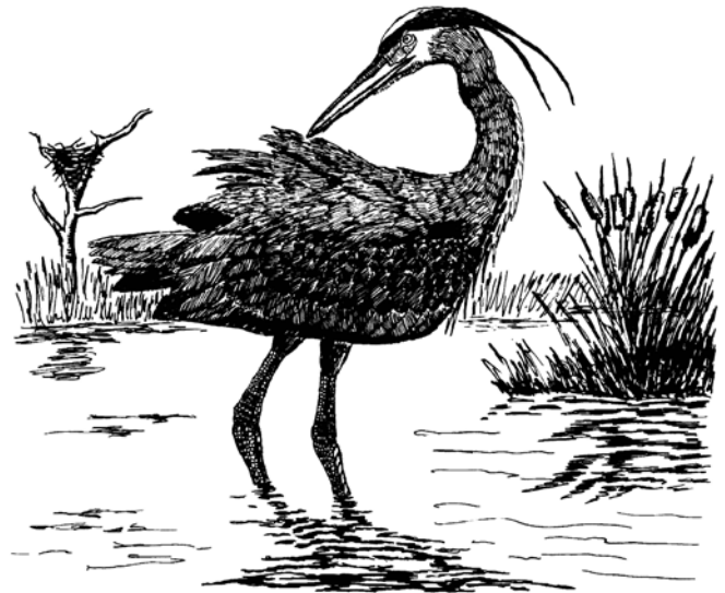
Great Blue Heron in habitat Artist Steven D'Amato

Snowy Plovers program Tree Swallow Nest Box Project Bird Island Monitoring White Tailed Kites Monitoring Wind Farm Studies Condors and lead ammunition Phenology Study UCSB Faculty Housing habitat protection. Habitat restoration at COPR and Arroyo Hondo San Marcos Foothills Coalition City of Goleta General Plan comments San Jose Creek Flood Control & Fish Passage Project Goleta Beach Erosion EIR Comments Global Warming Earth Day MAX Project