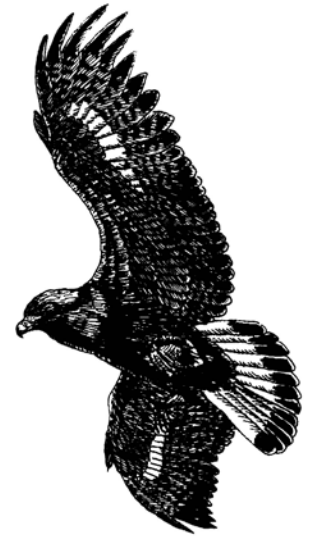
Golden Eagle Juvenile Artist Steven D'Amato

We will arrive around 9:15 a.m. and bird for about two hours near the ranch house where there are a large number of feeders and bird habitat. Then we will take an easy walk around the general area and perhaps take a tour of a canyon. Bring water, a snack and/or lunch.