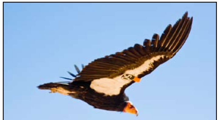
California Condor