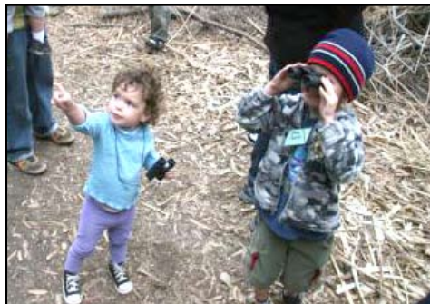
The next generation of birders.