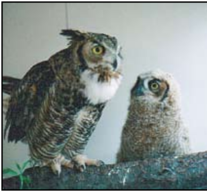
Max with Owlet