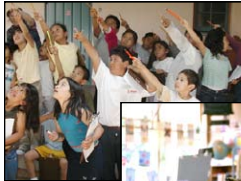
School yard bird walk.

EITS supports itself through program fees, fundraisers, private donations and foundation grants, from organizations such as Morris Mayer Kaplan Foundation, Santa Barbara Foundation, High Tide Foundation, Audubon California, and the Coastal Fund.