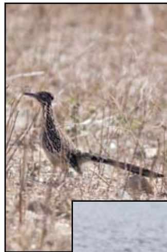
Road Runner spotted on the Las Cruzitas field trip, left. and Grebes seen on the 2008 Field Trip to Lone Star Ranch, below.

We will meet at the 5 Points Shopping Center (Carl's Jr) at 6:45 a.m. and at the Kmart parking lot in Goleta at 7:00 a.m. and car pool to the Rancho Guadalupe Dunes Preserve. If you would like to meet us at the dunes at 9 a.m., take Hwy. 101 north to Hwy. 166 (Main St. exit in Santa Maria) and head west towards the Guadalupe Dunes. Cross Hwy. 1 and continue on Hwy. 166 for 7 more miles to the parking lot. (Added attraction: optional lunch at the Far Western Tavern in Guadalupe.)