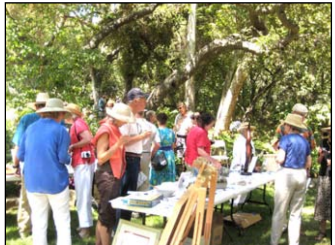
Silent Auction in full swing.