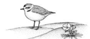
Snowy Plover by Peter Gaede

Sightings of PA:BY 6/28/2006 at COPR 9/16/06 at Sandspit 11/14/06 at Sandspit SB 12/15/06 at Sandspit 7/5/08 nesting at McGrath