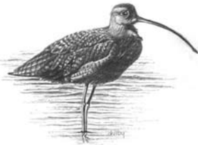
Long-billed Curlew

Directions: From the north on Hwy. 101, take Linden Ave. off ramp. From the south on Hwy. 101 take Casitas Pass Rd. off ramp, Turn right on Carpinteria Ave. and left on Linden Ave. Follow Linden Ave towards the ocean and turn right on Sandyland Rd. Go to the end; the Nature Park entrance is directly ahead.