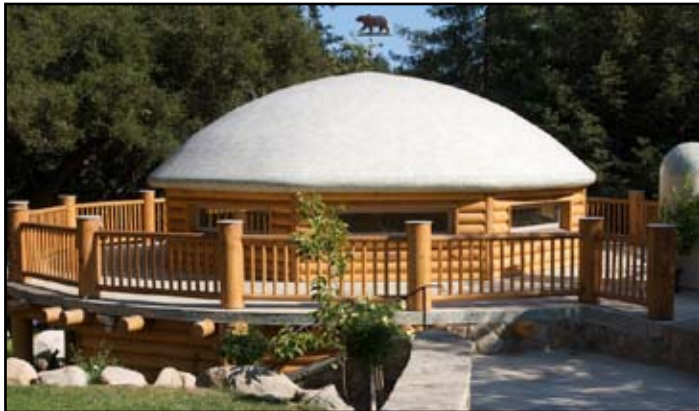
Creekspirit Foundation's home.