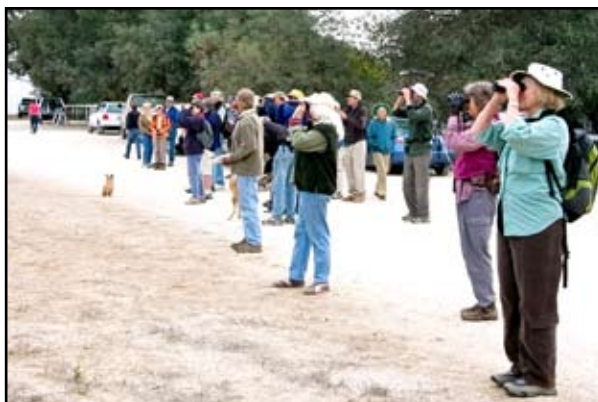
2007 SBAS Las Cruzitas Ranch field trip.