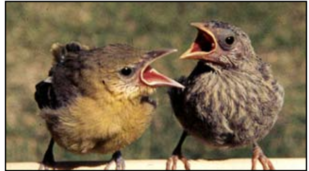
Hooded Oriole and Cowbird fledglings.

Steve will give a brief overview of parasitic birds and the special opportunities they offer for studies of evolution, followed by a summary of his research on song dialects and song development in cowbirds. Cowbirds require a great bit of learning to develop their vocal repertoires yet they learn only from other cowbirds even though they are always raised by other species. Steve will then address the issue of cowbirds as a threat to other songbirds. While cowbirds are a serious threat to a small number of endangered passerines and, therefore, must be controlled in some circumstances, cowbirds have been demonized to a large extent and blamed for far more damage than they have caused. This demonization has resulted in the excessive use of cowbird control, which deflects attention and funding from the most important threat to endangered songbirds, namely the habitat destruction we have inflicted on ecosystems, especially in riparian areas of the West. Making cowbirds into scapegoats ignores the facts that they have been in North America for at least a million years and are a natural component of its biodiversity.