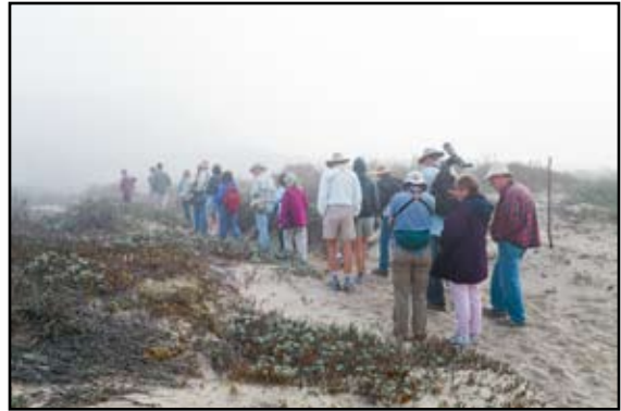
The group heads into the dunes.

The 3 mile route took us a full mile down the beach to Coal Oil Point Reserve and the pond trail. Along the way, we stopped at the Snowy Plover reserve, where we saw dozens of them hunkered down in their furrows. There were good numbers of shorebirds and gulls there as well.