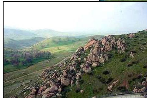
Views of the Tejon Ranch.

El Tecolote is published 6 times a year by the Santa Barbara Audubon Society, Inc.