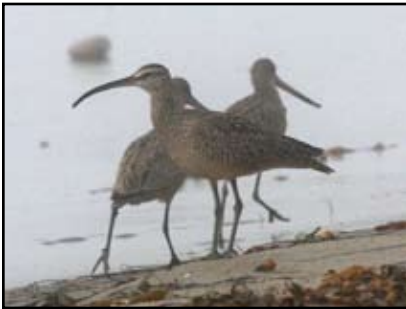
Whimbrel and Margled Godwits.