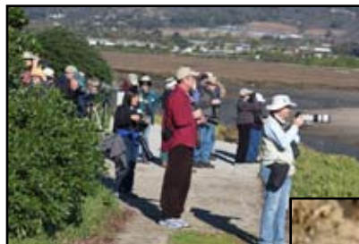
Birders had a great view of the Carpinteria Salt Marsh.