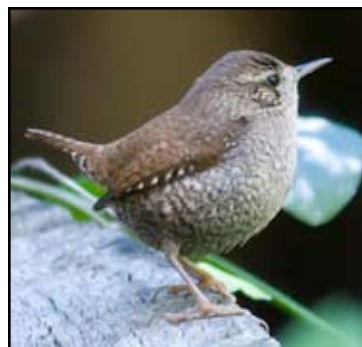
Eastern Winter Wren

With birder numbers soaring, we’ll be out there counting with more and more people every year. At least, that is our goal. Let’s hope we’ll be fortunate enough to protect the bird life that makes Santa Barbara so famous, too.