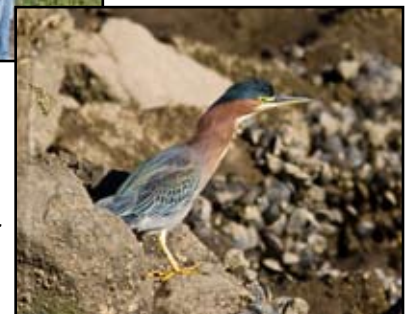
Green Heron