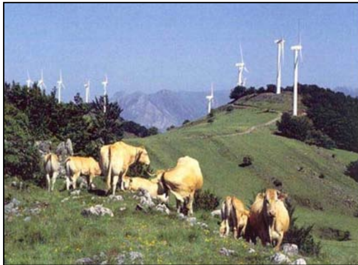
Wind Farm in Similar Setting (Spain).

On February 10, 2009, the Santa Barbara County Board of Supervisors approved the Lompoc Wind Energy Project (LWEP). The project, which will be built by the Spanish company Acciona, includes 65 wind turbine generators (WTGs) producing about 1.5 MW each on 3000 acres of private grazing land in San Miguelito Canyon about 5 miles southwest of Lompoc. Each WTG will be about 400 feet tall from base to tip of blade, with blades about 130 feet long.