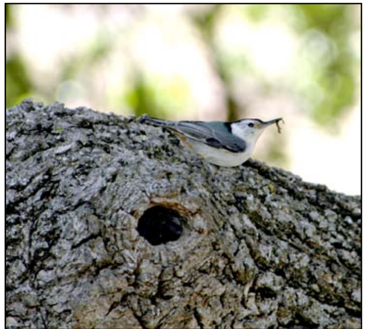
White Breasted Nuthatch, Sedgwick Reserve.

Directions: Take Hwy. 101 to Hwy. 166 (Santa Maria). Stay on Hwy. 166 to Maricopa and continue on Hwy. 166 to the WWP turnoff (13 miles from Maricopa). Look for the WWP sign on the right hand side of Hwy 166. The total mileage from S.B. to WWP is approximately 155 miles.