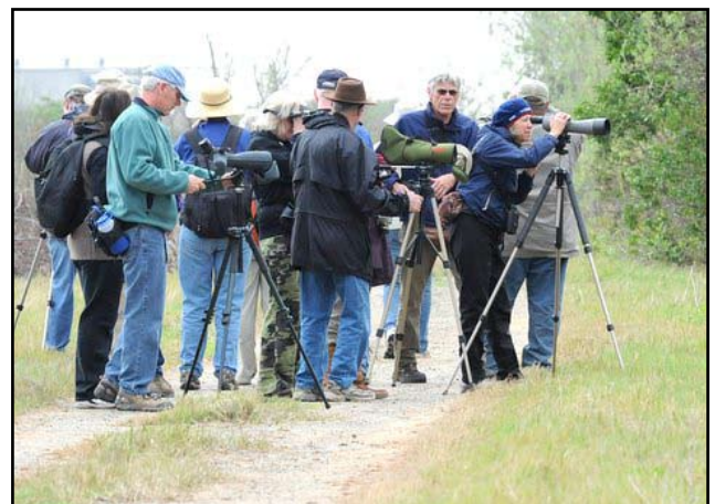
Birding Group