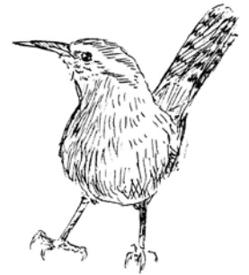
Wren