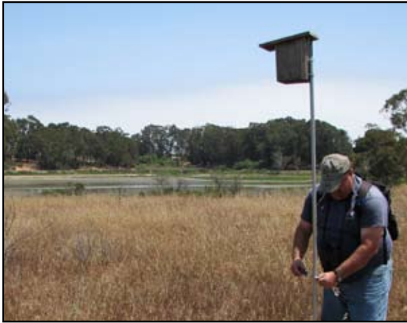
Dave Eldridge checking a Tree Swallow nest box at Devereux

cavity nesters, Bewick's Wrens and Oak Titmice, were observed to use a few of the boxes. The strategy of moving/modifying boxes that don't get used for a few years has afforded a steady increase in overall nesting activity and the desired result of nests producing fledglings. Most fledglings have been produced at COPR, but both sites have had success. During 2008, 27 young were fledged from nest boxes. Volunteer Dave Eldridge has been an instrumental force in changing the project from being barely successful into one now showing moderate success. His careful field observations and ideas for positive changes have been significant.