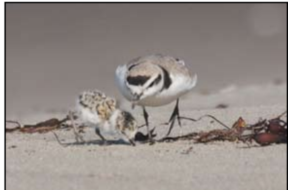
Snowy Plover chicks and other sites at Coal Oil Point Reserve

Those interested should call to register at (805) 893 3703