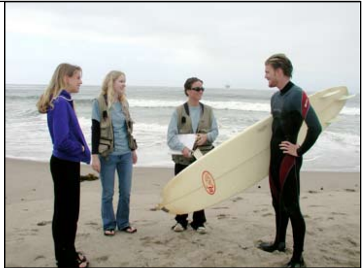
Snowy Plover program docents talk with beach user.

Today, conservation is in the hands of people. The Endangered Species Act is a powerful tool but it is people who make sure the ESA is applied, enforced, and recognized. The Santa Barbara Chapter of the Audubon Society is a model organization for mobilizing people who want to be active in conservation and restoration. Briefly: I don't know what I would do without you. Thank you!