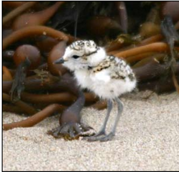
Snowy Plover chick P

November is when we tally how many Snowy Plover chicks fledged in the breeding season. This year is particularly exciting because we had a record 60 chicks, a number far beyond our expectations when we started managing back in 2001. But each year, we learn more about plovers and what we can do to help. The education program, spearheaded by the Santa Barbara Audubon Society (SBAS), is a key element of this successful program. It teaches visitors about the ethics of beach recreation so beach-nesting birds can complete their life cycle while we have fun. It is the work and collaboration of non-profits such as SBAS and of the University of California, Santa Barbara's Coal Oil Point Reserve (COPR) that have brought this local beach back to its original splendor of diversity.