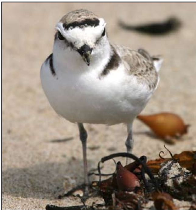
Snowy Plover

In addition to managing people, we also manage the habitat and the species that are endangered or threatened. In a place like COPR, active management is needed to reduce the impact of human development nearby. For example, our food web lacks large predators because the native area is too small to support mountain lions, and coyotes are actively removed from surrounding neighborhoods. This leads to an overpopulation of some nest predators such as crows, raccoons, and skunks. Some years, the skunks are so abundant that we have to trick them by replacing the real plover eggs with wooden eggs. Then the real eggs must be returned to the nests on the beach on the very