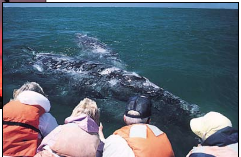
A friendly California Gray Whale and her calf enjoy a little people watching.