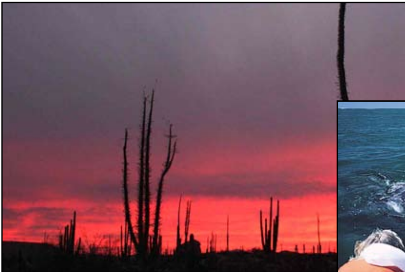
Baja Central Desert sunset with boojums and cardon cacti.