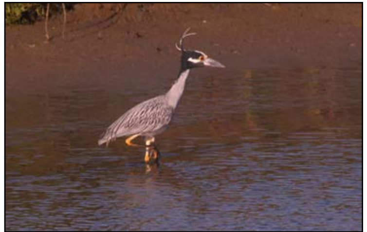
Yellow Crowned Night Heron stalking.