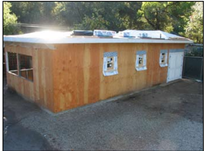
Progress continues on the aviary at the Santa Barbara Museum of Natural History.

Our expected move-in date may be during the latter part of December. Six years in the making: Hooray indeed!