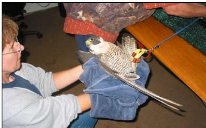
"Angel" being outfitted with falconry equipment.

Sadly she cannot be released back into the wild, as her wing recovery halted after three months at about 90% functionality. Now, that may sound good, but for a Peregrine falcon, a 90% lopsided flight ability just isn't good enough. Peregrines, the fastest animals on earth, need 100% to perform the split-second adjustments they need to make during chases or dives that can reach up to 240 mph. (Visit http://video.nationalgeographic.com and search for "High-velocity Falcons" to watch.)