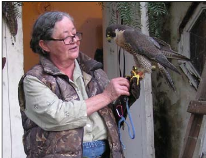
“Angel’s” first chance to look over her new home.

In other news, the new aviary at the Santa Barbara Museum of Natural History is nearing completion (picture 4). The roof is now finished, doors and windows are installed, and electrical and plumbing are done. Next are exterior siding, window netting and interior walls. Last will be the security shutters.