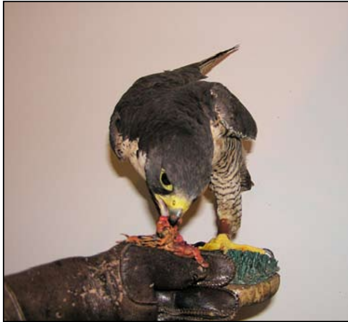
EITS' New Peregrine accepts quail treats.