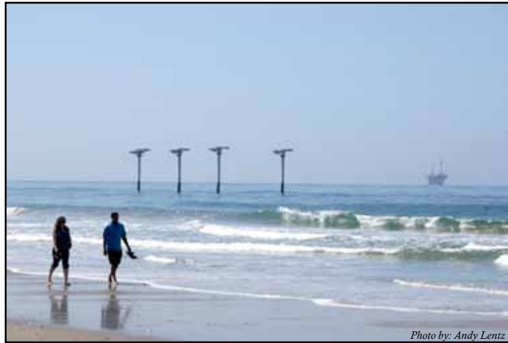
Bird Islands seen from Haskall's Beach.

Since 2005 SBAS has been monitoring the birds of Bird Island off the Goleta Coast. “Old Bird Island” was the remnants of an oil platform several hundred meters off the Ellwood coast. It was home to nesting Brandt’s Cormorants, roosting California Brown Pelicans (federally listed as endangered until 2009), and several other bird species. The remains of the old platform were removed in the fall of 2005 by the owners, BP/ARCO. As a mitigation measure they replaced the breeding and roosting habitats with four new structures in the fall of 2005 designed to accommodate the nesting and roosting birds.