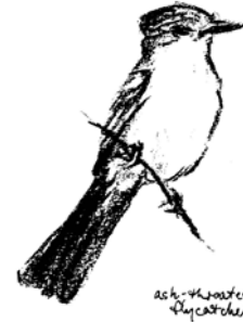
Ash-throated Flycatcher

Don't miss out on this opportunity to bird the private and unique Hollister Ranch.