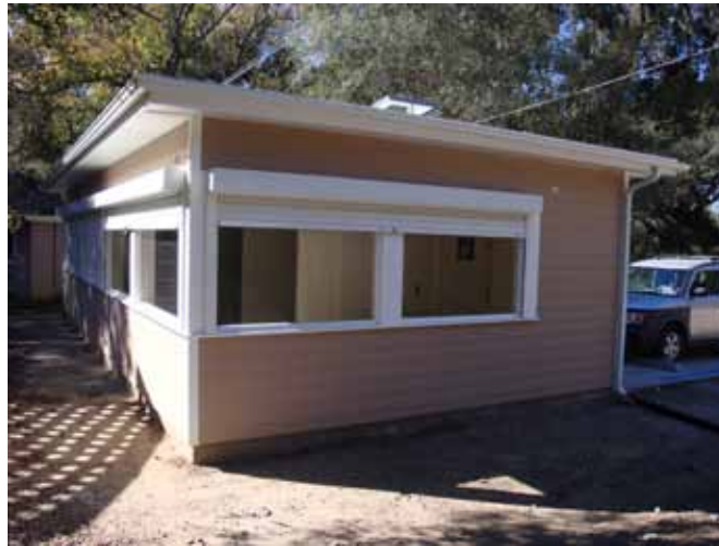
The new aviary.

After a seven year process, we have now moved into our new aviary at the Santa Barbara Museum of Natural History. Thank you all for your generosity, especially during these hard financial times. I hope that, as our partner in this venture, you will feel pride in our joint accomplishment. Thanks to you, we also raised the $1,500 for a guard rail that keeps busy fingers and pressing faces away from the aviary netting. Construction will most likely be completed by the time you read this.