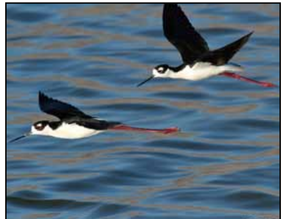
Black-necked Stilt