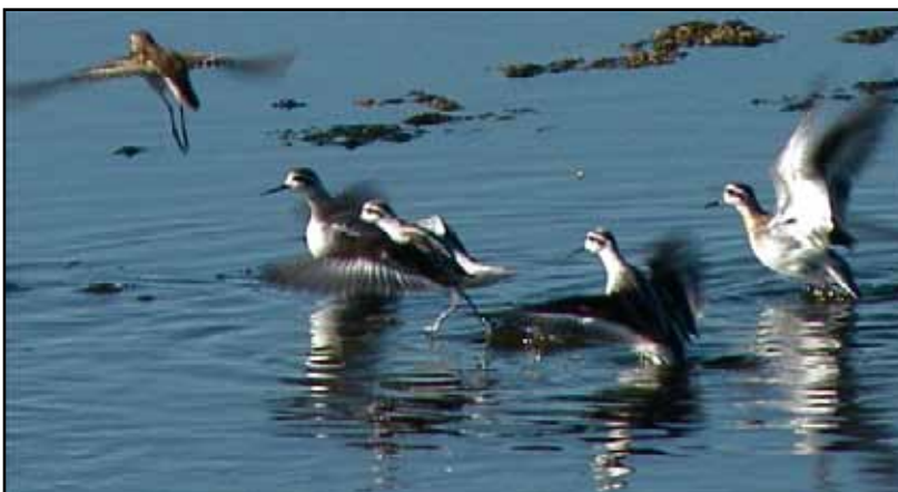
Red-necked Phalaropes at Owens Lake