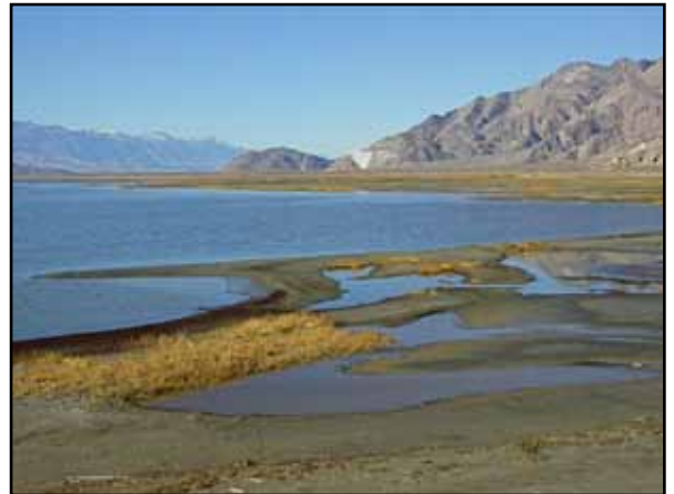
Owens Lake