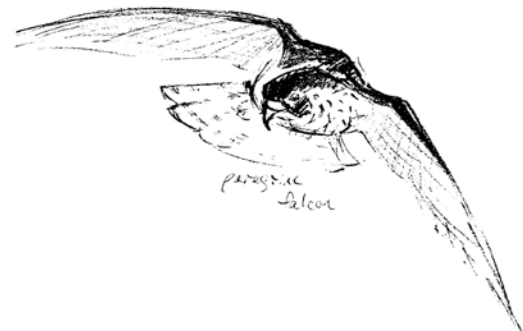
Peregrine Falcon in flight.