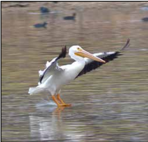
American White Pelican at Laguna Blanca