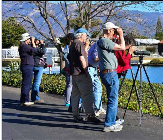
Birders at Rancho Goleta enjoying the Tufted Duck

The tipu effect, as we began calling it, re-energized our scouting and birders all over the county began poking around places normally not birded during count day. City parks, parking lots and residential streets all became birding destinations, and several rarities turned up as a result. Still, birding the normal riparian, coastal, chaparral, foothill and mountain habitats was slow.