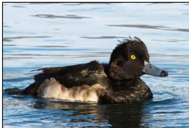
Tufted Duck at Rancho Goleta Mobile Home Park

In the end—and it's not yet over but the count is settling into firm numbers—our CBC tallied 222 species, 2 fewer than our highest count ever, topping the list for California CBCs and ranking 2 nd in the nation. What began as a slow and somewhat dull season has become a near record-breaker. However, the CBC is not all about the species total. At press time, we are still tallying the individual birds and looking at