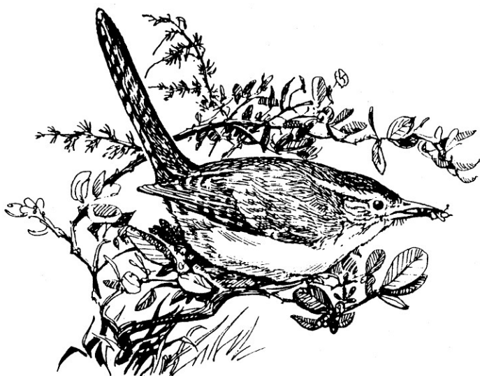
86 K. Toole Bewick's Wren in Ceonothus + Chamise

Please contact the Audubon office if and when you can actively participate. ...Tomi Sollen