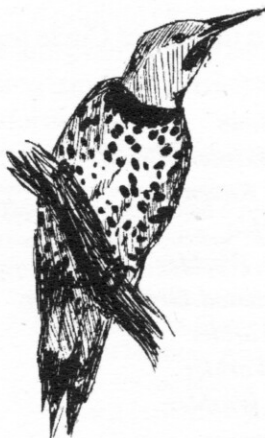
Northern Flicker

S BAS's September fundraiser "An Afternoon of Art and Wine" was a big success as well as great fun! Thank you to everyone who helped make this a wonderful afternoon!