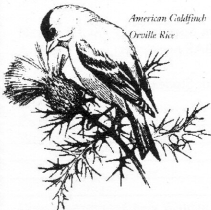
American Goldfinch

Non-profit Organization U.S. Postage PAID Santa Barbara, CA Permit Number 125