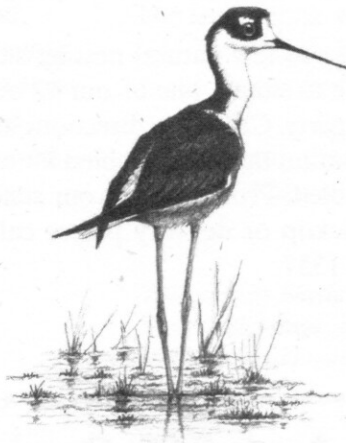
Black-necked Stilt By Daniel S. Kilby

Cattle Egret Blue-winged Teal Greater Scaup Mountain Quail Common Moorhen Virginia Rail Black-necked Stilt Lesser Yellowlegs Long-billed Curlew Common Snipe Thayer's Gull Greater Roadrunner any owls (other than Great Horned) White-throated Swift any non-Anna's Hummingbirds Sapsuckers (other than Red-breasted) Horned Lark