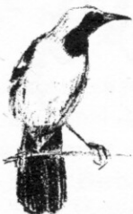
Hooded Oriole By Kirsten Munson

Plus: any montane species such as: Mountain Chickadee , Red-breasted Nuthatch , Townsend's Solitaire , Varied Thrush , Brown Creeper , Pine Siskin or Cassin's Finch .