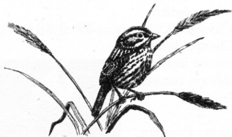
Savannah Sparrow