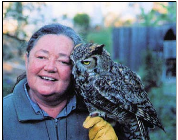
Reunion.

As soon as he saw me he began begging like a baby and chattering excitedly. I had barely lifted up my hand to offer him when he flew down, but fell off the glove somewhat