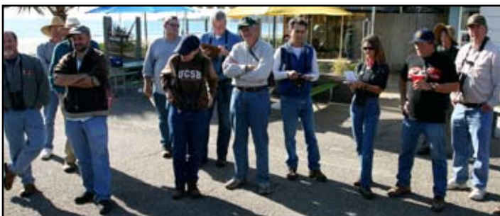
Mid day meeting.

All in all, it doesn't get any better than this. Let's celebrate our incredible bird diversity and lovely climate by going out birding every day of the year—not just for the Christmas Bird Count!