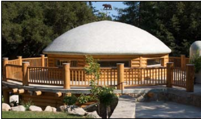
Creekspirit Foundation's home.