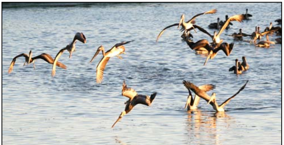
Pelicans fishing at UCSB Lagoon

Coming from the north on Hwy. 101, take the Fairview Ave. off-ramp and head towards the ocean. Fairview Ave will turn into Fowler Rd. Turn right into the Goleta Beach County Park. We will park and meet at the west end of the Goleta Beach parking lot (nearest the UCSB campus).