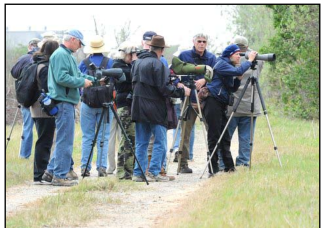
Birding Group