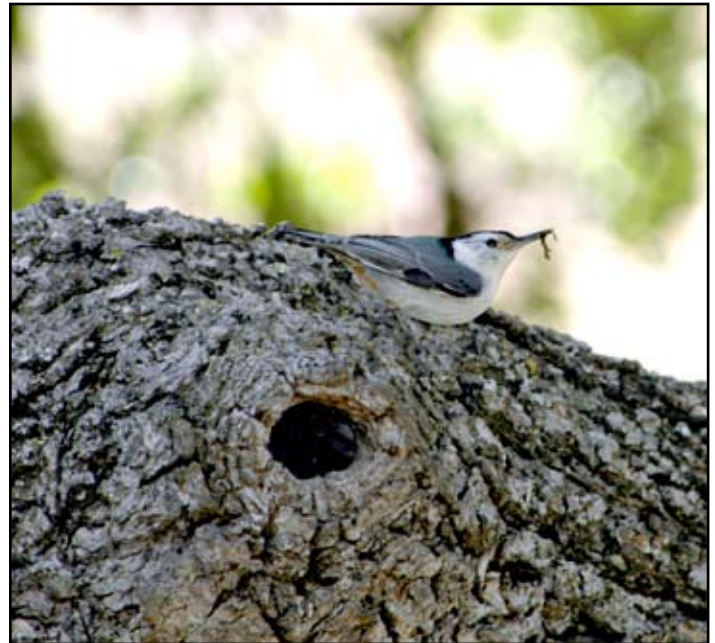
White Breasted Nuthatch, Sedgwick Reserve.