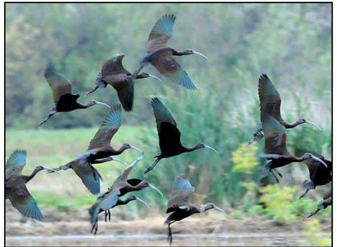
White-faced Ibis