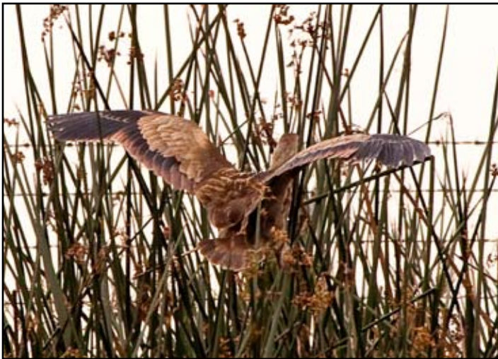
American Bittern

As we skirted the Pt. Mugu northern boundary, tree swallows were on the fence, and hundreds of ibis were flying and settling in ponds close to us. All agreed it was breathtaking. Although the day was crisp, the usual wind did not come up. This allowed us to spend four hours enjoying this private reserve. The four scopes came in handy as we focused on the raptors including many Red-tailed Hawks, Northern Harriers, and American Kestrels. We heard many Marsh Wrens, and a few birders got good glimpses of the fast-moving, camouflaged bird. Toward the end of our day, a Tundra Swan was spotted at a far pond. Sixty-nine species were the day's count including those spotted at the Bird Refuge meeting location.