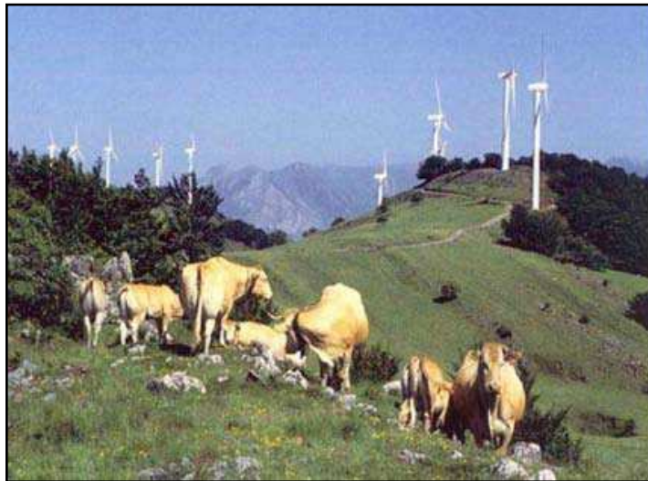
Wind Farm in Similar Setting (Spain).

On February 10, 2009, the Santa Barbara County Board of Supervisors approved the Lompoc Wind Energy Project (LWEP). The project, which will be built by the Spanish company Acciona, includes 65 wind turbine generators (WTGs) producing about 1.5 MW each on 3000 acres of private grazing land in San Miguelito Canyon about 5 miles southwest of Lompoc. Each WTG will be about 400 feet tall from base to tip of blade, with blades about 130 feet long.