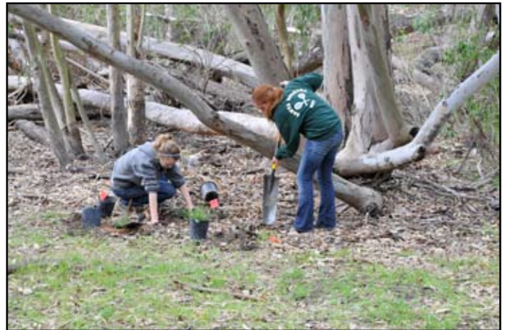
Two volunteers from the Santa Barbara High School Green Club