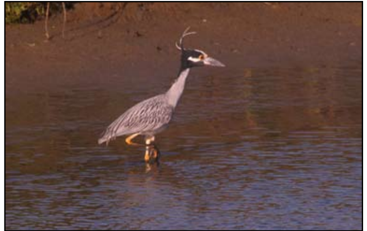
Yellow Crowned Night Heron stalking.