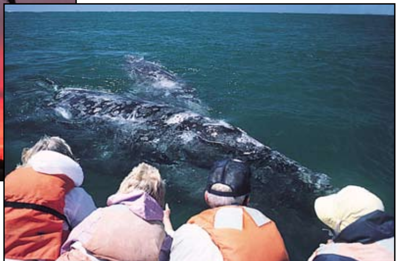
A friendly California Gray Whale and her calf enjoy a little people watching.