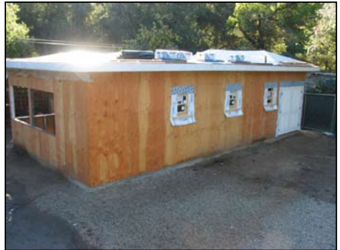
Progress continues on the aviary at the Santa Barbara Museum of Natural History.

Our expected move-in date may be during the latter part of December. Six years in the making: Hooray indeed!