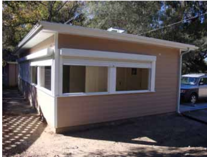
The new aviary.

After a seven year process, we have now moved into our new aviary at the Santa Barbara Museum of Natural History. Thank you all for your generosity, especially during these hard financial times. I hope that, as our partner in this venture, you will feel pride in our joint accomplishment. Thanks to you, we also raised the $1,500 for a guard rail that keeps busy fingers and pressing faces away from the aviary netting. Construction will most likely be completed by the time you read this.