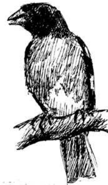
Black-headed Grosbeak Artist: Kirsten Munson