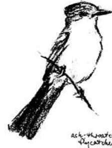
Ash-throated Flycatcher

Don't miss out on this opportunity to bird the private and unique Hollister Ranch.