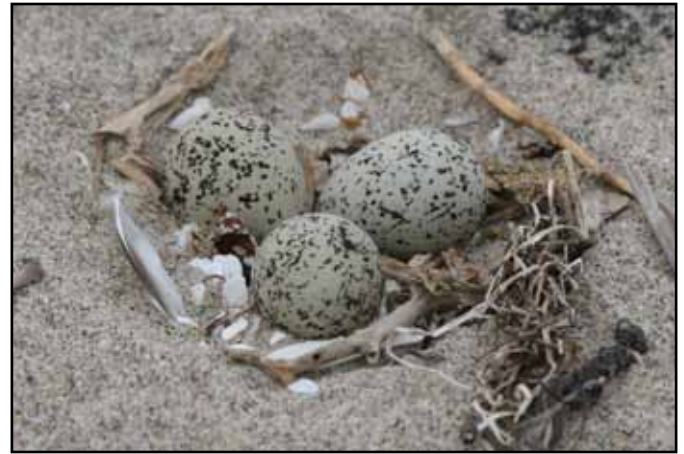
Typical Snowy Plover nest.

remaining in the U.S. Pacific population. Also important, we, as a collaborative team, have educated uncountable numbers of people. We also continue to learn each year about the very complex ecology of the beach habitat. We can celebrate our success!