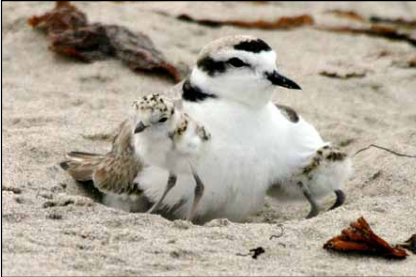
Snowy Plover with chicks.

Santa Barbara Audubon Society has partnered with Coal Oil Point Reserve (COPR) for the last ten years. Our chapter developed the curriculum and raised the funds to start the Snowy Plover Education Program.