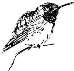
Hummingbird perched Artist Kirsten Munson

We will bird a loop trail along the beach past the Snowy Plover reserve, by the pond below the storage tanks, around the top and east side of the slough, and back to the cars.