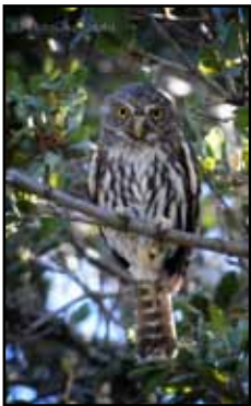
Northern Pigmy Owl