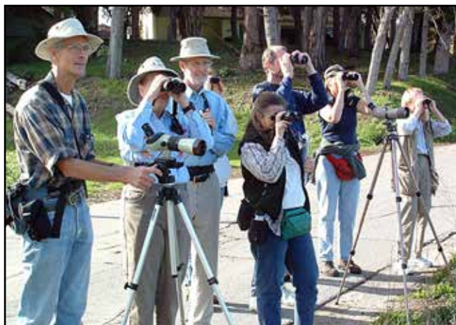
Christmas Bird Count, 2003.

Let's keep building on our traditions. For more information concerning the 113 th count, to be held on January 5, 2013, go to www.casbbirdcount.org .