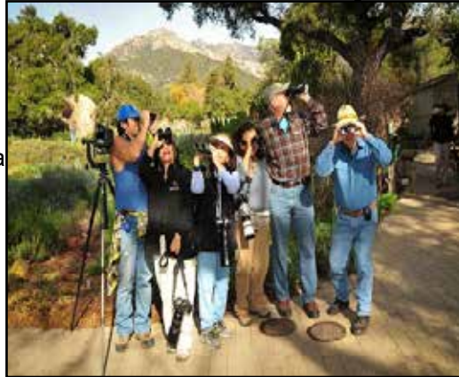
A flock of SB birders on count day.