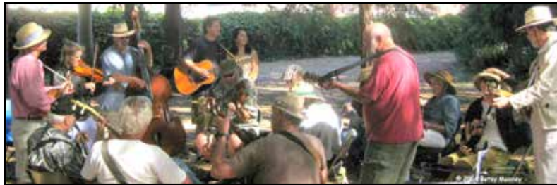
Glendessary Jam provided music for the occasion