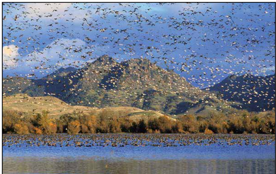
Butte Sink Wildlife Management Area in northern California provides habitat for hundreds of thousands of waterfowl in the Pacific Flyway, especially in winter.