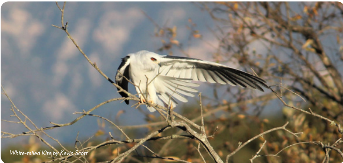
White-tailed Kite