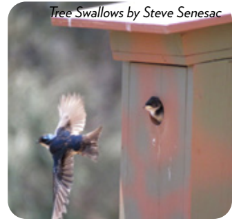
Tree Swallows by Steve Senesac

In addition, we've added a recording of John Callender's recent program on the Carpinteria Snowy Plover population. To watch footage of these irresistible chicks, learn more about them, and bring a smile to your face, visit our ADDITIONAL RESOURCES web page at https://santabarbaraadubon.org/additional-resources/videos/ .