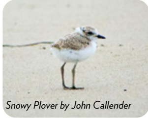
Snowy Plover

Thanks to technology and our science project monitoring nest boxes of Tree Swallow (TRES), we've recorded some TRES behavior during breeding season and have uploaded a short movie on our LEARNING RESOURCES web page, https://santabarbaraadubon.org/learning-resources/ .