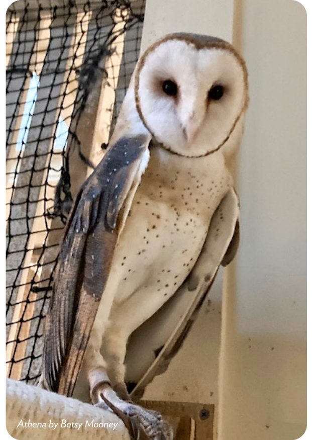
Athena

We hope for a winter of classroom presentations in breezy outdoor spaces, easing into an in-person presence after keeping a careful distance for so long. It's a mission made possible by the volunteers who care for these birds day in and day out, sharing their beauty year after year with a new generation.