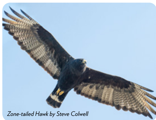
Zone-tailed Hawk by Steve Colwell

The Santa Barbara count circle's center point is the intersection of Cathedral Oaks Rd and Highway 154, and its area radiates out 7.5 miles in all directions. Before Count Day, you can help by keeping eyes open and ears tuned during your outings within these boundaries. Let us know about the following interesting or unusual birds: