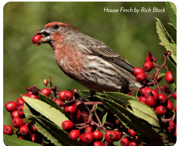
House Finch