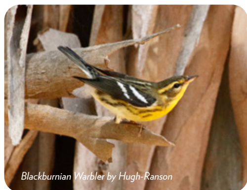
Blackburnian Warbler

Many thanks to those of you who have recently joined or renewed or gifted a chapter membership to others. Your support is key to our success!