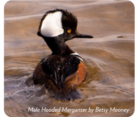
Male Hooded Merganser