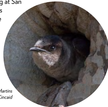
Purple Martins