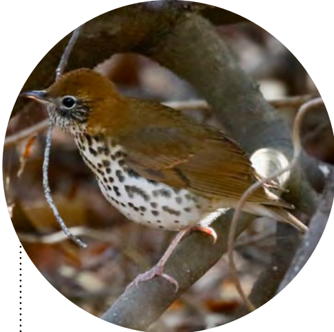
Wood Thrush