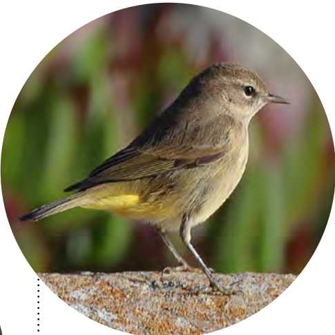
Palm Warbler