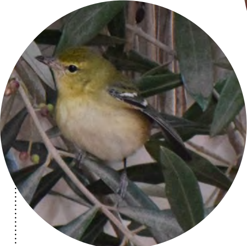
Bay-breasted Warbler