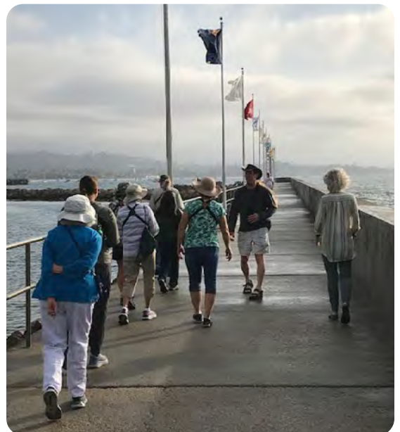
Santa Barbara Breakwater

Target Birds: waterfowl, winter songbirds, raptors