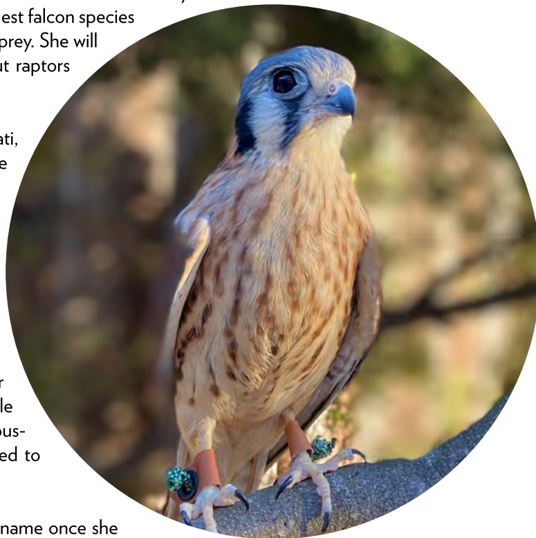
EITS Ambassador American Kestrel

Following EITS tradition, the volunteers will vote on her new name once she arrives at the aviary in the Santa Barbara Museum of Natural History. We are excited to welcome a new bird into the family!