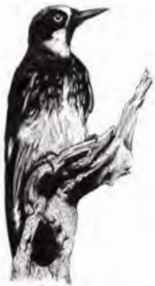
Acorn Woodpecker

Make this your New Year's resolution and help Santa Barbara Audubon grow even stronger!