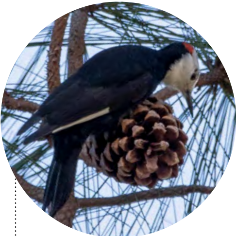
White-headed Woodpecker