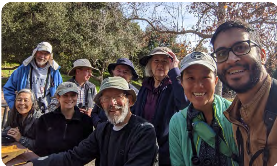
The Tucker's Grove group birding in the park at a past CBC event.

As I write this, a few days into November, the first rain of the season is soaking our region, bringing with it an audible sigh of relief from plants, birds, and birders alike. While I have a healthy caution about predictions, there is definitely an air of hopeful things to come. The drought has wearied all of us, and the low lake levels, dry creeks, drought-stressed trees, and generally grim conditions are impossible to ignore. These few rainy days are a tonic, especially coupled with our recent fall migration season. During its peak, the insect-riddled trees in business parks continued to highlight the changing “hotspots” where migrating birds concentrate when drought limits options for feeding. With a few exceptions, places we have birded for decades—small patches of riparian habitat along creeks and near the coast—have been underwhelming compared to the tipu and eucalyptus trees infested with psyllids that form a sticky honeydew