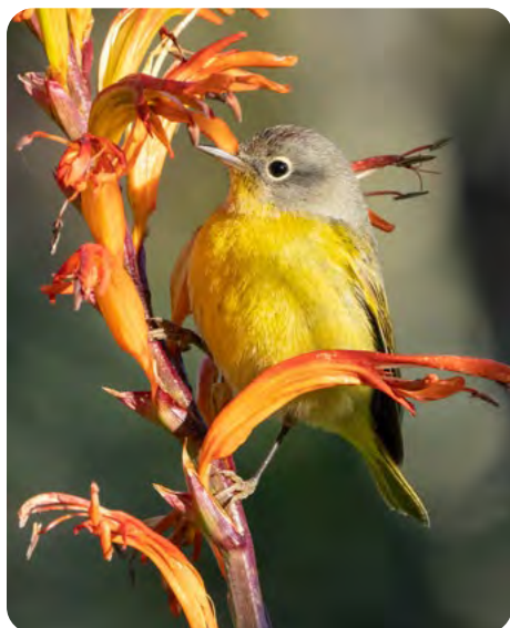
Nashville Warbler from 122nd CBC.

on the leaves, creating a feeding bonanza for birds. This phenomenon is not new, but the lack of suitable food and water availability elsewhere has concentrated birds in these easy-to-reach places, where birders have enjoyed sightings of vagrant warblers, vireos, and flycatchers, as well as catching up with friends after the long months of COVID-19 isolation.