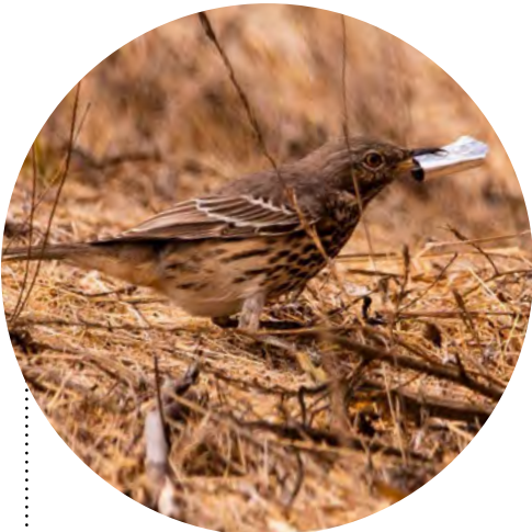
Sage Thrasher