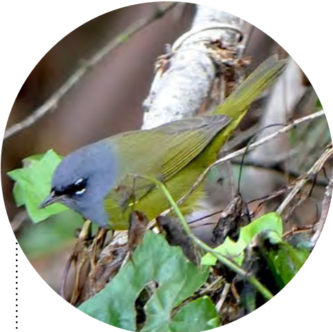
MacGillivray's Warbler