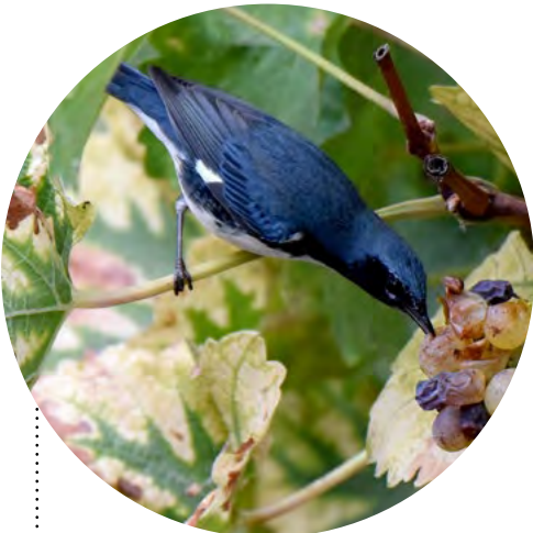
Black-throated Blue Warbler